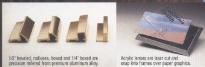
1/2" beveled, radius, boxed and 1/4" boxed are precision mitered from premium aluminum alloy.