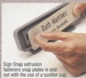
Sign Snap extrusion fasteners snap plates in and out with the use of a suction cup.